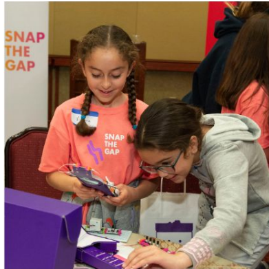
Hands on learning with littleBits

Our program is no-cost and includes three key components to impact the STEM opportunity gap: