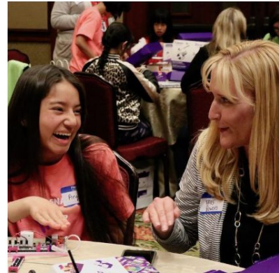
Mentorship by an inspiring adult in STEM