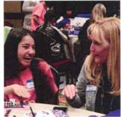
Mentorship by an inspiring adult in STEM