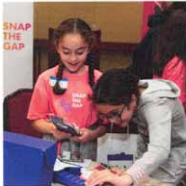
Hands on learning with littleBits

Our program is donation-based and includes three key components to impact the gender gap: